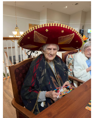
What a beautiful sombrero!