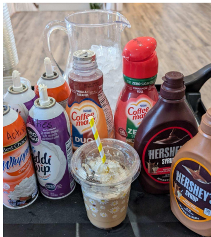
The residents and employees enjoyed the iced coffee bar!