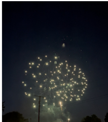
Residents watched the fireworks on 4th of July!