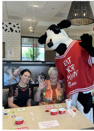
Having fun with the Chick-fil-A cow!

I bought a winter jacket at the store last August I got a really good deal because I bought it before it was cool.