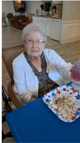
4th of July Social