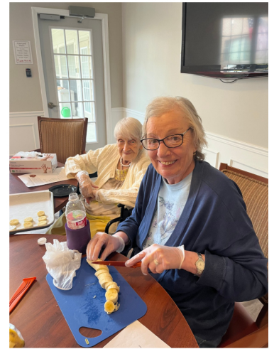
Making pan fried cinnamon bananas. Yum!